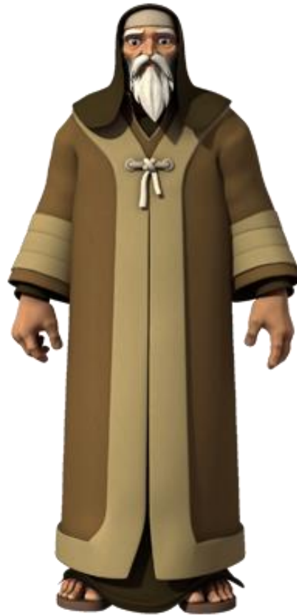
ABRAHAM Gen 12:1-3