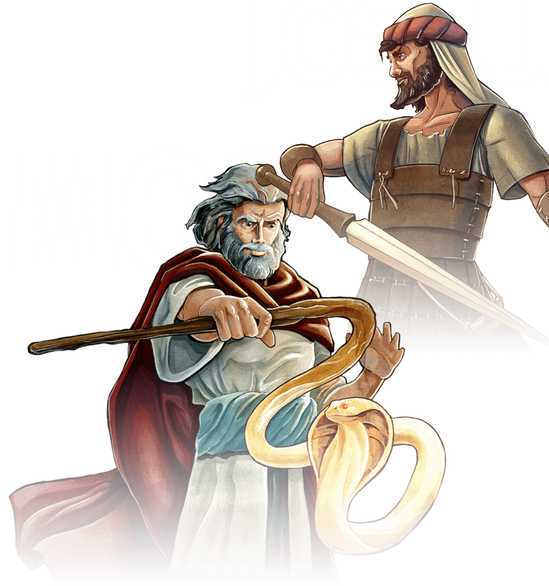
MOSES & JOSHUA Exodus & Joshua