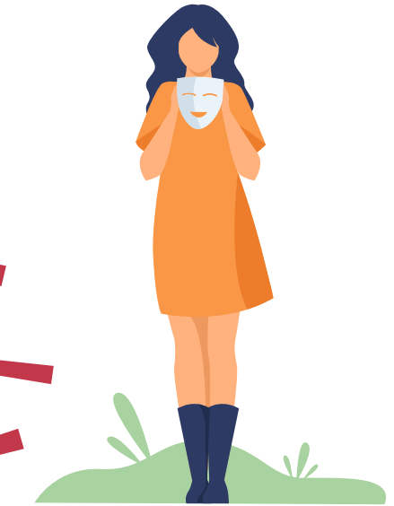
5. HEAR BUT DON'T NOT DO (Matt 7:26-27)