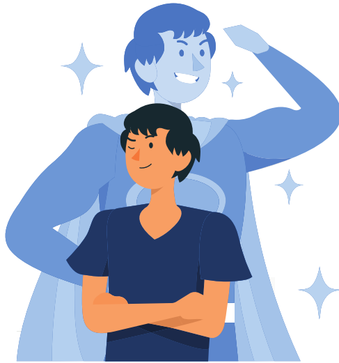
2. ASSUMPTION (1 Cor 10:12)