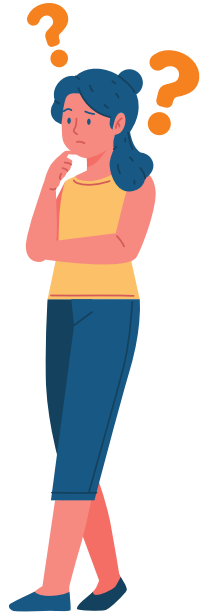
1. IGNORANCE (1 Cor 10:1)