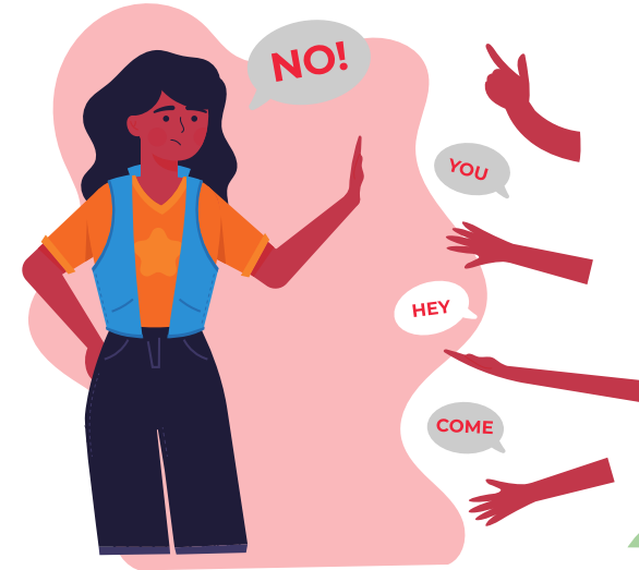
4. UNBELIEF (Heb 3:7-8; 6:1-2)