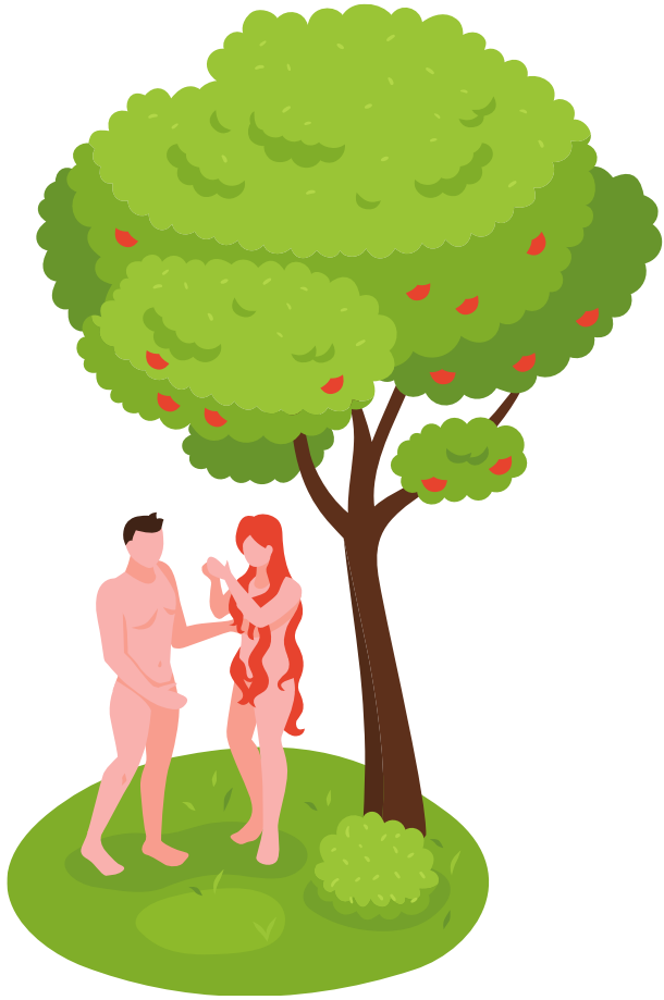
ADAM & EVE Gen 1:26-28